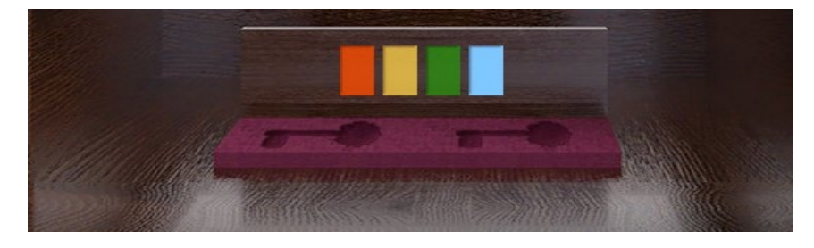
Using these examples, the hypothetical pass code would be: 1243

This is an example of the color code you might see, not the actual color code itself.